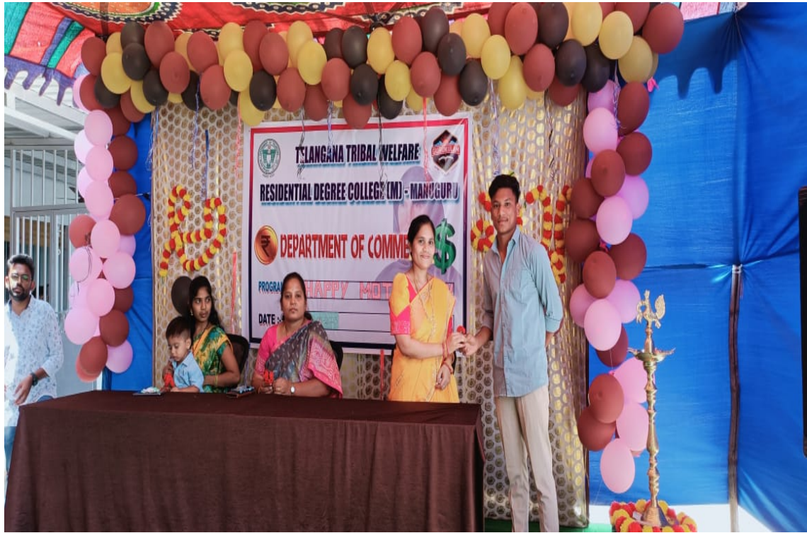
Conducted Games to Women Faculty