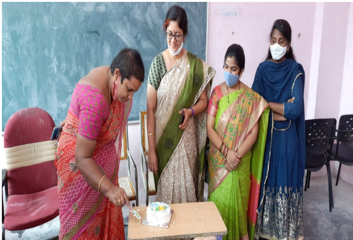
Cake Cutting by women Faculty on Celebration Women's Day.